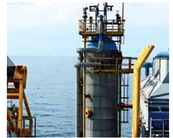
Offshore Drilling Rig