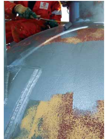
Rust Grip® penetrates deep into the pores of and seals the surface from further corrosion.

Corrosion prevention and protection for the past 50 years has yielded inefficiencies for industries that depend on critical infrastructure. With many of these methods, limited success is achieved because most corrosion coatings are “glue-on-to-surface.” This process doesn’t allow for corrosion to be controlled in the pores of applied surfaces and won’t protect against mold and mildew among other environmental toxins