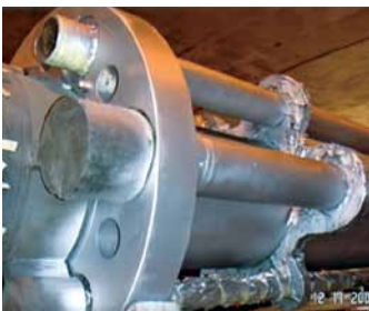
Drill Pipe Risers