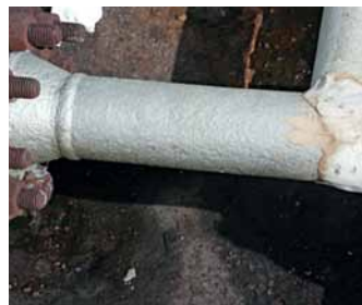
Corrosion Under Insulation