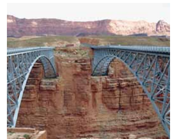
Hoover Dam Bridge