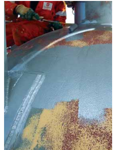
Rust Grip® penetrates deep into the pores of and seals the surface from further corrosion.

Corrosion prevention and protection for the past 50 years has yielded inefficiencies for industries that depend on critical infrastructure. With many of these methods, limited success is achieved because most corrosion coatings are “glue-on-to-surface.” This process doesn’t allow for corrosion to be controlled in the pores of applied surfaces and won’t protect against mold and mildew among other environmental toxins